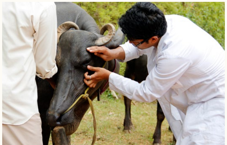
HEAL - Nepal will link farmers with livestock service providers to help them avoid further losses due to death of livestock assets.