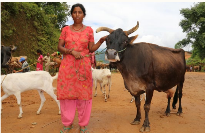
Livestock is an integral component of the farming system that supplements cash income, improves dietary diversity and helps increase agricultural productivity through draft power and manure.

“Mobilizing local community based livestock service systems to help earthquake-affected households protect livestock assets.”